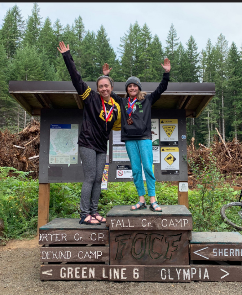
529 Youth Legion rider on the Capitol Forest podium, Washington

We have consciously strived to make 529 Legion an inclusive team and have branched out in age, gender equality, sexual orientation, ethnicity, and level of fitness and skills. We have grown our Youth Program and our Ladies Legion.