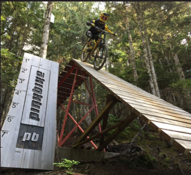
Lorant dropping into Clown Shoes, Whistler

Ladies Legion has been a subset of 529 Legion for years. This year we have increased our rides with younger women, older women and some new friends who had never mountain biked before! We host an encouraging women-only ride once a month that always encompasses progression and ends in hugs and smiles.