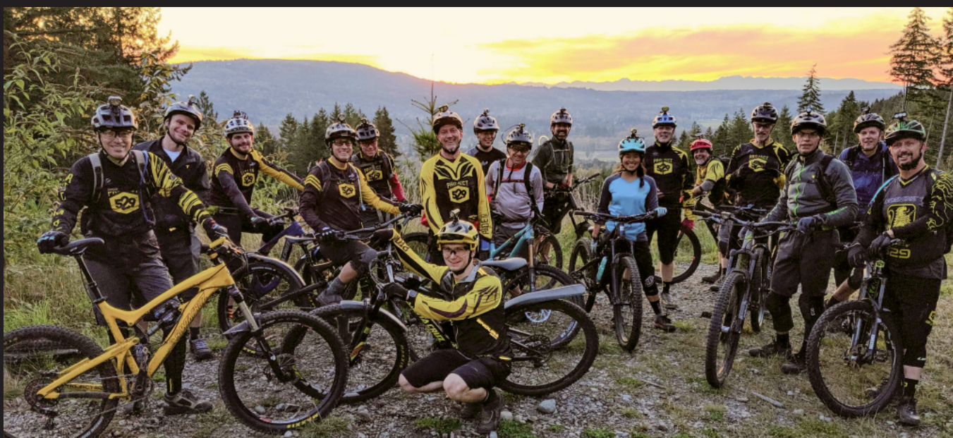
Riders at Thursday Night Ride work 9 to 5, but live 5 to 9

Our Thursday Night Rides have been officially providing an open invitation to ride local area trails with a bunch of 529 Legion riders for 16 years. We start the ride at 6:00 pm. We end the evening with dinner. Some nights we have five riders but other nights the group is as large as 25 riders forming a couple of smaller groups. It is a great opportunity for everyone on 529 Legion to introduce friends to the sport, meet new riding buddies and always know we've got a chance to ride before the weekend.