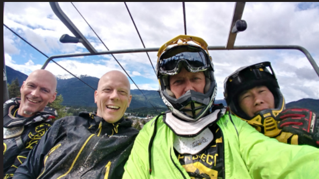
Greeting fans on Instagram from the lift chair, Whistler

Our Thursday Night Rides have been officially providing an open invitation to ride local area trails with a bunch of 529 Legion riders for 16 years. We start the ride at 6:00 pm. We end the evening with dinner. Some nights we have five riders but other nights the group is as large as 25 riders forming a couple of smaller groups. It is a great opportunity for everyone on 529 Legion to introduce friends to the sport, meet new riding buddies and always know we've got a chance to ride before the weekend.