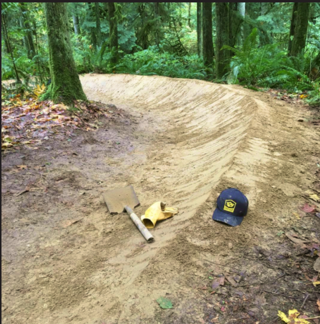
529 member donating time to improve trails for the community