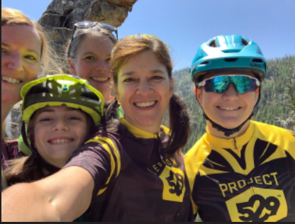
Ladies Legion and Youth Legion

The 529 Legion Youth Program guided eight middle and high school kids into participating in their first community cross country mountain bike races. Coaching in the WA Student Cycling League (WSCL) put us into contact with kids from families that were not aware of the opportunities in our area. Their parents didn't know how to get their enthusiastic riders into a competitive format in the area. We provided information and support to get the kids racing in a local series, and most of them had a chance to stand on the podium at least once!