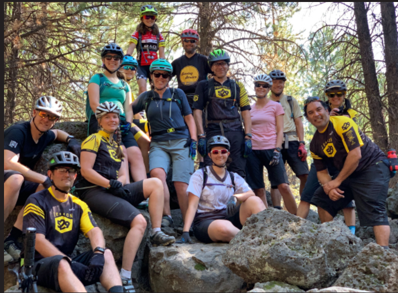
529 Legion and our extended family

529 Legion has been enthusiastic about bikes for 16 years. We have been out on trails riding, racing, advocating, building and supporting. In that time, our club has grown just as a family would. We've diversified our racing to include enduro, epics, and cyclocross. We've moved members around the world and we've become a little more diverse in our demographics. We have come to realize that 529 Legion is more than bikes, it's about the people, the trails, and the communities we love. This year we highlight and celebrate the diversity in our mountain bike family.