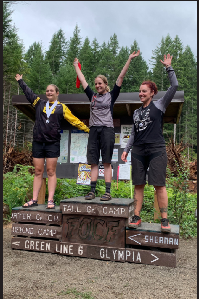
When she wins, we all win